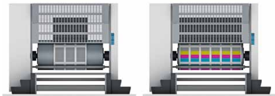
All KBA RotaJET L Series presses share the same hardware platform and can be upgraded on site from a mono system with a web width of 777 mm to a 4C system with a max. web width of 1380 mm

Customizing and Flexibilität – there’s a name for that! The KBA RotaJET L Series. Its modular design offers unique upgradeability and makes the RotaJET L Series one the most future-proof high-volume inkjet printing systems on the market, serving a wide range of different application fields.