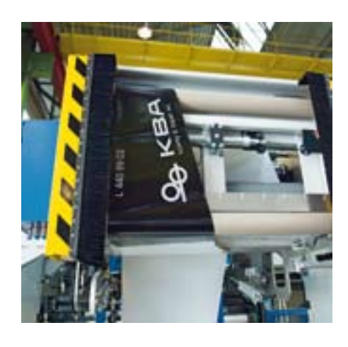
A chain web-up device is available as an option