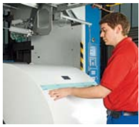
Automatic reelstand that splices precisely at maximum press speed

The KBA Pastoline can be integrated in a diagnostics and reel-data system, and linked to our service department via a service PC and 24-hour hotline that enables service personnel to conduct remote interrogations online via our service and diagnostics network.